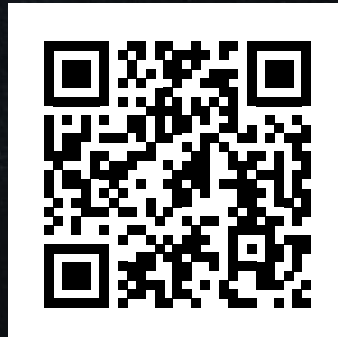
Blast Hole Video